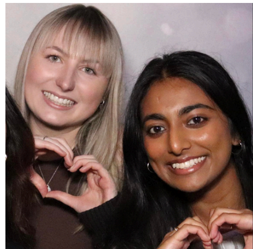
EDUCATION & PSNZ