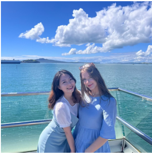
GRASSROOTS & WELFARE