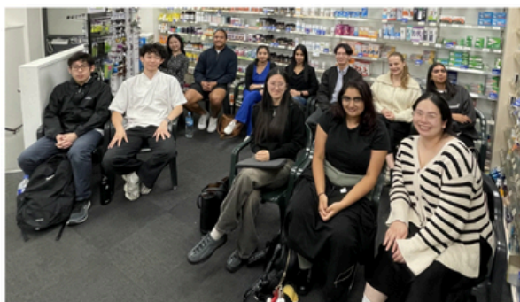
2024 Totem Intern Pharmacists at a group training session.